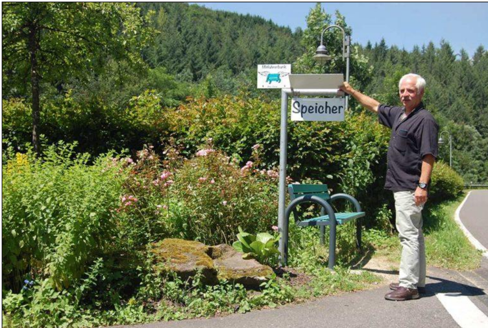
Figure 2 – Bench and pole